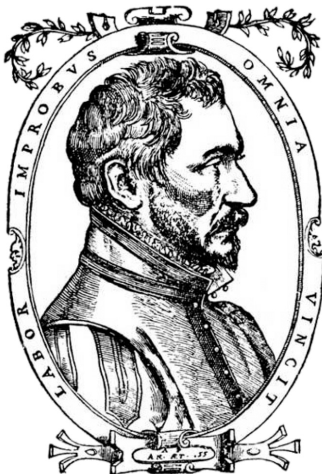
FIG. 1. Portrait of Ambroise Paré. Reprinted from Paré A. Ten Books of Surgery, with the Magazine of the Instruments Necessary for It . Athens, GA: University of Georgia; 1969.

Paré eventually traveled to Paris in 1530 for a residency at the Hotel Dieu. At the time, the Hotel Dieu was the only truly public hospital in Paris serving the poor. Run by the clergy and staffed by medical interns and externs, the hospital provided essential medical,