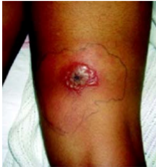
Large coalescence of thin-walled bullae on an erythematous base located on the right posterior thigh.