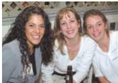
Lasting friendship captured at the AOTA party.

Alumni Association was ready on April 20, 2001, to host a Reception for OT Alumni at the historic Reading Terminal Market. Nearly 300 OT alumni, faculty, students and visiting guests were treated to a wonderful venue with antique railroad luggage carts laden with selections of cheeses, crudite and dips, as well as cheerful waiters circulating the crowd with specialties provided by different Market vendors. Remembering old times and sharing new ones was a priority as partygoers stayed past the 7-9 pm event and enjoyed the Market piano player well into the evening.