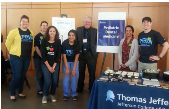
JCPH and Jefferson Pediatric Dental Medicine at Philadelphia Science Festival Explorer Sunday for Aspiring Health Professionals.