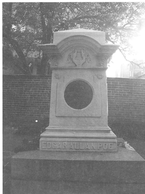
Edgar Allan Poe's monument in Baltimore. An interesting side trip during the Annual Conference.

Revue Internationale d'Ingénierie Numérique publishes articles in all areas of mathematics, standardization, systems analysis, database development, and new applications of CAD/CAM and robotics. Articles in the latest issue deal with a history of Boolean operators, geometric modeling using SolidWorks, 3D modeling using superellipsoids, and automation for stamping metal cylinders. (French Language – English Abstracts)❖