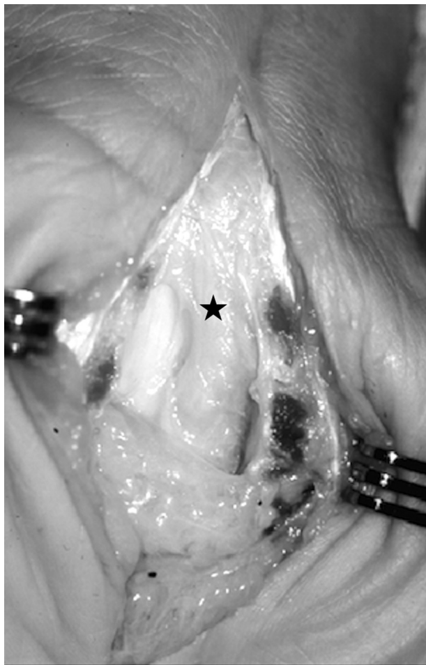
Fig. 2 Open approach to allow visualization of potential residual compression sites and adhesions around the median nerve (star).

may compress the median nerve must be removed at this surgical stage (► Fig. 2 ). Any totally or partially damaged nerve site must be repaired with a nerve graft. Ulnar nerve decompression in the Guyon canal can be performed if required. 5