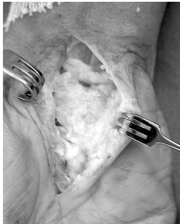
Fig. 3 An hypothenar fat pad flap was performed to interpose adipose tissue from the hypothenar eminence between the median nerve and overlying transverse carpal ligament and surgical scar.

The concept of vein interposition, placing the vein around the median nerve as a barrier to prevent scarring, was originally described in rats but it has been used clinically. 48,50 The surgical technique consists of releasing the median nerve from cicatricial adhesions and identifying the region to be covered by a vein. After harvesting 25 to 30 cm, the saphenous vein is opened longitudinally. With the