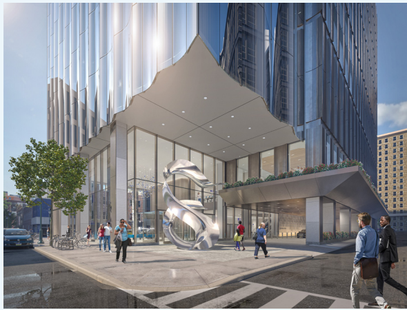
As the third-tallest building east of Broad Street, the Specialty Care Pavilion at 1101 Chestnut Street will transform the Center City skyline.

The Specialty Care Pavilion represents the most significant new patient care facility at Jefferson since the 1970s. With a total cost of more than $762 million, it will serve as a model for modern medical facilities and a cornerstone of Jefferson’s Center City, Philadelphia campus.