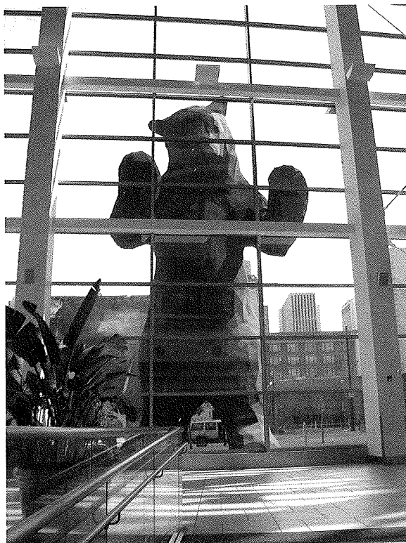
A non-human conference attendee who unfortunately had to participate from the sidewalk.