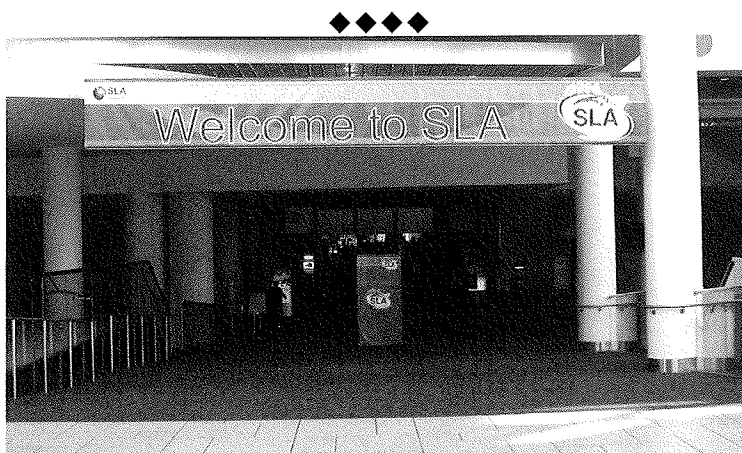
The conference center welcomed us.