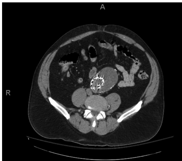
Fig 2. Axial section of a computed tomography angiogram showing a thrombosed Endologix aortic stent graft with a sacular abdominal aneurysm measuring 6.0 × 5.1 × 4.4 cm from the 12- to 3-o'clock position.

infrarenal aorta was clamped, and the sac was cleared. The aortic portion of the EVAR stent graft was explanted, which had a large thrombus within the lumen (Fig 3). The bilateral iliac