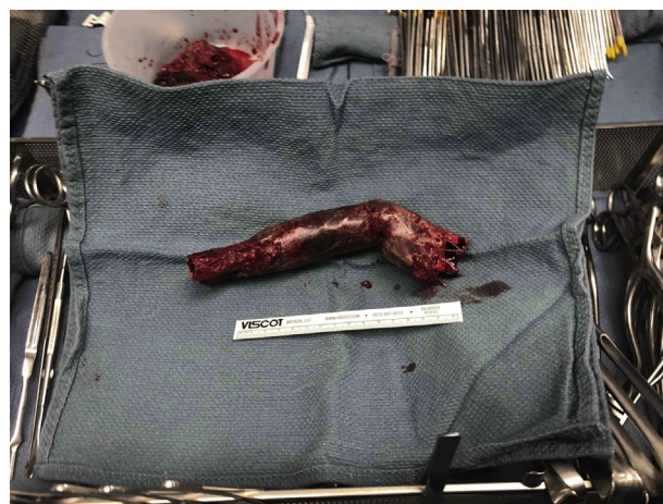
Fig 3. Explanted Endologix aortic stent graft showing kinked deformation. Top left corner, a bucket containing mural thrombosis that had been inside the aneurysm.

infrarenal aorta was clamped, and the sac was cleared. The aortic portion of the EVAR stent graft was explanted, which had a large thrombus within the lumen (Fig 3). The bilateral iliac