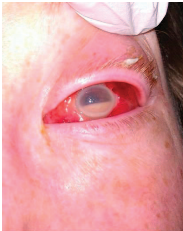
Figure 1. Patient’s eye exam on day 3 of hospitalization, revealing significant hypopion and haziness of the cornea.

Initial vital signs revealed a temperature of 98.6 degrees Fahrenheit, heart rate of 88 beats per minute, respiratory rate of 21 per minute, blood pressure of 160/94 mmHg, and 95% oxygen saturation on room air. Physical exam was significant for a diffusely erythematous left sclera with a hazy cornea and a small hypopion occupying the bottom third of the pupil (Figure 1). Her left pupil was sluggishly reactive to light. The patient’s visual acuity exam of the left eye revealed 20/60 vision (20/20 in right eye). Her left chest wall port site was non-erythematous with no palpable fluctuance or drainage. There was no tenderness to palpation in this area. Cardiac exam revealed a grade II/VI systolic ejection murmur most prominent at the right upper sternal border. There were crackles at both lung bases and bilateral 2+ lower extremity pitting edema to the shins. There were no splinter hemorrhages