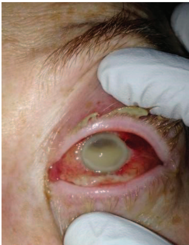
Figure 2. Patient's eye 7 days after admission. Notable are increased swelling, pus, worsening hypopyon.