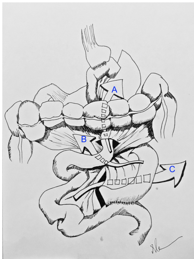
Figure 2 Internal hernias of retrocolic Roux-en-Y gastric bypass. (A) Transverse mesocolic defect. (B) Petersen's defect. (C) Jejunojejunostomy mesenteric defect.

endoscopy or abdominal ultrasounds and potentially delaying therapy. 55,56 Cross-sectional imaging may reveal telltale signs of internal hernia, such as mesenteric swirl or obstructive patterns and engorged mesenteric nodes. 57 However, CT imaging has a suboptimal sensitivity for internal hernias in patients with a history of bariatric operation and may be read as normal in up to 30% of patients. 54