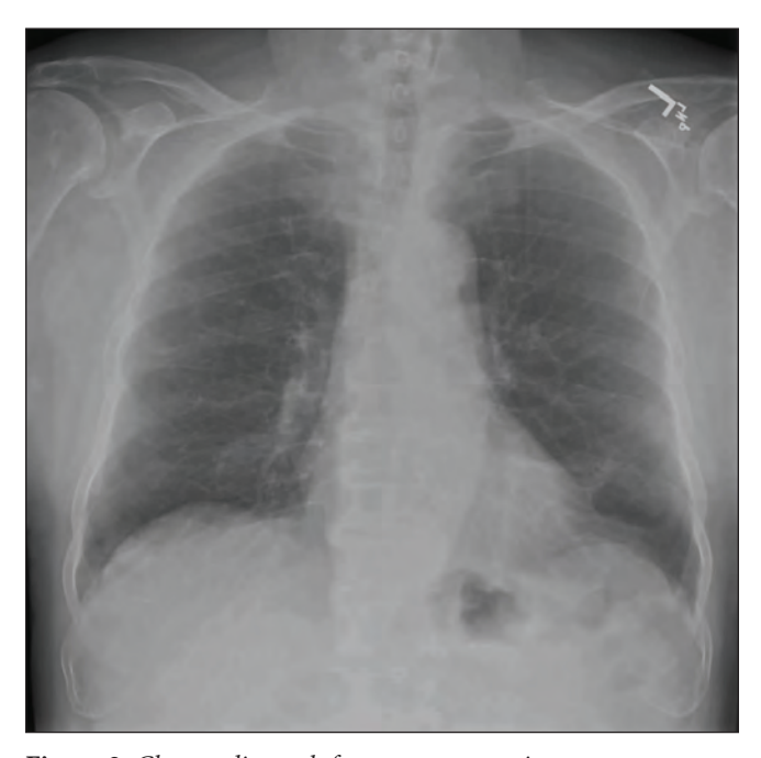
Figure 2. Chest radiograph from two years prior to current admission is unremarkable for any lesion or mass

Klebe S, et al. Sarcomatoid mesothelioma: a clinical-pathological correlation of 326 cases. Modern Pathology 2010; 23: 470-479.