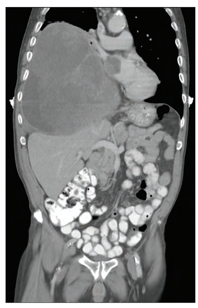
Figure 3. Choronal computed tomography (CT) of the abdomen/pelvis with reconstruction shows a circumscribed loculated mass with extension into the left atrium via right pulmonary vein (white arrow)