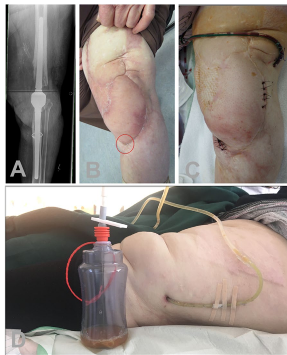
Fig. 3 Images of a patient who underwent a curative arthrodesis of the left knee. a This was after multiple septic debridements and plastic surgery using a free flap. b After six years, a chronic infection in line with cutaneous fistula is present. c Accordingly, a persistent fistula using a 16 CH drainage tube was performed. d Patients regularly have to undergo maintenance of the drainage system

Due to the organizational and psychological burden of PF, the indications thereof should be comprehensively discussed with each patient. Troendlin et al. reported a rejection rate of >80% after a prolonged and vexatious course of illness [40]. PF is often performed to achieve faster convalescence and reduce further hospitalization, and such expectations often cannot be satisfied as, on average, three additional revision surgeries are needed after the PF was established [40]. The most common complication in patients with PF is closure of the fistula, with a potentially fatal course of the disease leading to sepsis [40]. The functional outcomes prior to and after PF are often identical and revision arthroplasty with implant removal has poorer functional outcomes after surgery compared to preoperation. A recent study of 159 patients with periprosthetic infection of the hip and knee, reported a poor functional outcome, with a Harris hip score (HHS) of 38.1 after PF, compared to 17.6 after Girdlestone resection [40]. Charlton et al. reported that the functional outcome after PF in periprosthetic infection of the hip was comparable to that after Girdlestone resection arthroplasty, with an HHS of 40 [41]. Patients