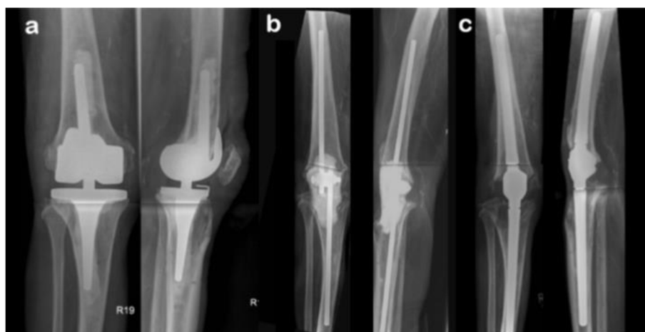
Fig. 2 a X-rays of a patient with a hinged cemented total knee arthroplasty. b X-rays after prosthesis explantation, various revision stages and debridements, which led to extensor insufficiency and bone loss, as well as patellectomized with fixed spacer. c The joint reconstruction is carried out by implanting a distance arthrodesis prosthesis (Knee Arthrodesis Module, Brehm, Germany)

Despite previous research efforts, an established standard regarding multistage arthroplasty revisions, including the use of spacers and the anchorage principles of the revision implant, have yet to be found [30].