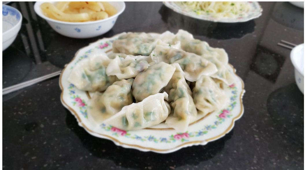
FIGURE 1: Steamed pork and chive dumplings

Food enthusiasts typically choose to photograph their plated meals through candid snapshots to capture both the presentation and the artistic décor. While this practice may prompt an occasional odd glance or sneer, capturing an image of the culinary experience allows one to easily access a food-related memory objectively and with pinpoint accuracy. Examples for the food evaluation lesson #1 are displayed in Figures 1-2.