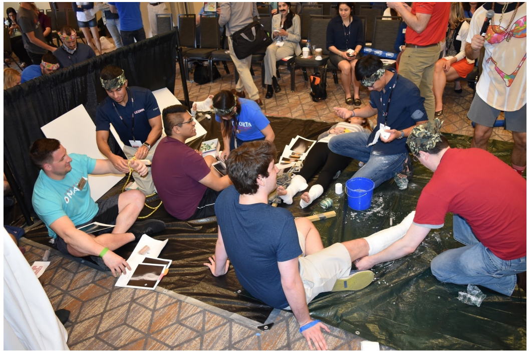
FIGURE 3: Participants are seen splinting a broken leg while matching X-ray images to injured patients as part of Round 1A.