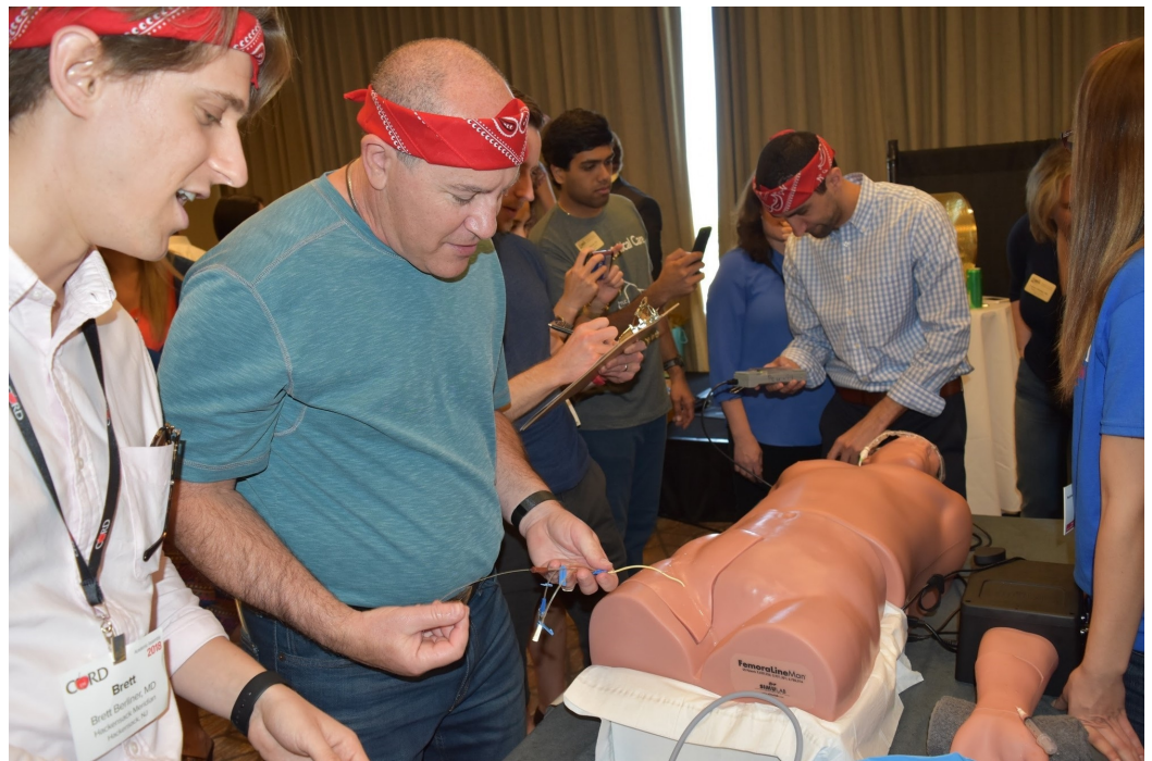
FIGURE 5: Participants are working to place a right femoral central line, right transvenous pacing as part of Round 2A.