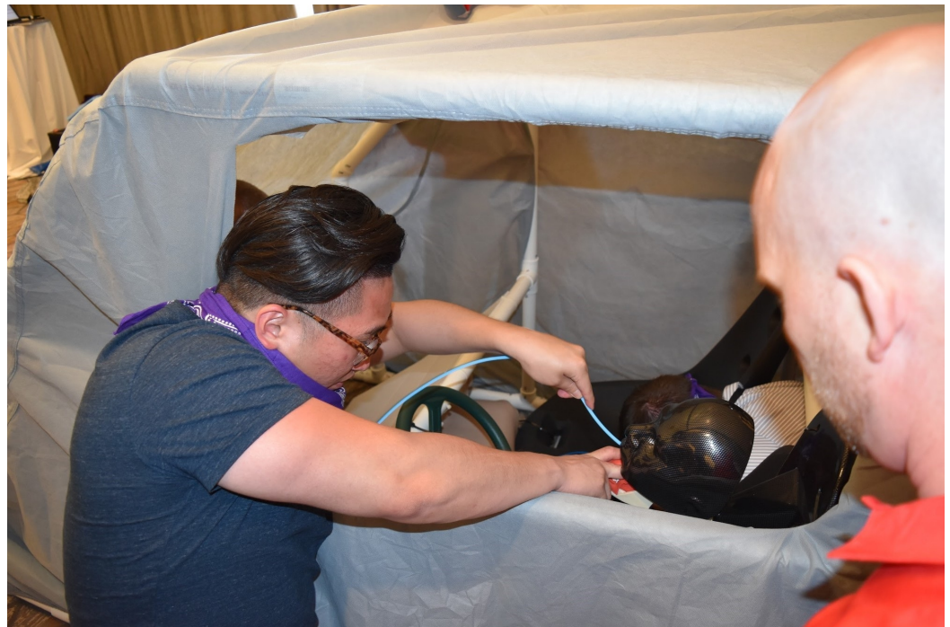
FIGURE 7: Round 3 involved intubation of simulated patients in a vehicle. Shown here is the PVC pipe made car, a simulated patient being intubated with a boogie and digital intubation technique.