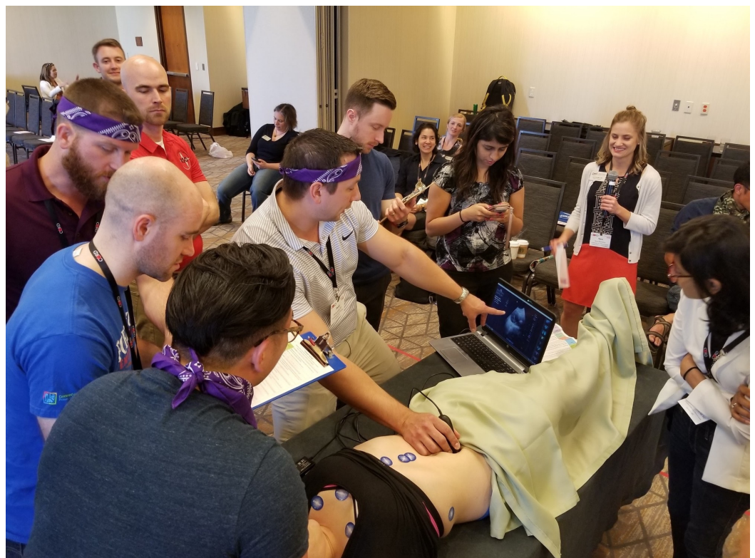
FIGURE 6: Participants using FUJIFILM SonoSim live scan technology to ultrasound pathologic images on a real patient used specially designed electronic stickers as part of Round