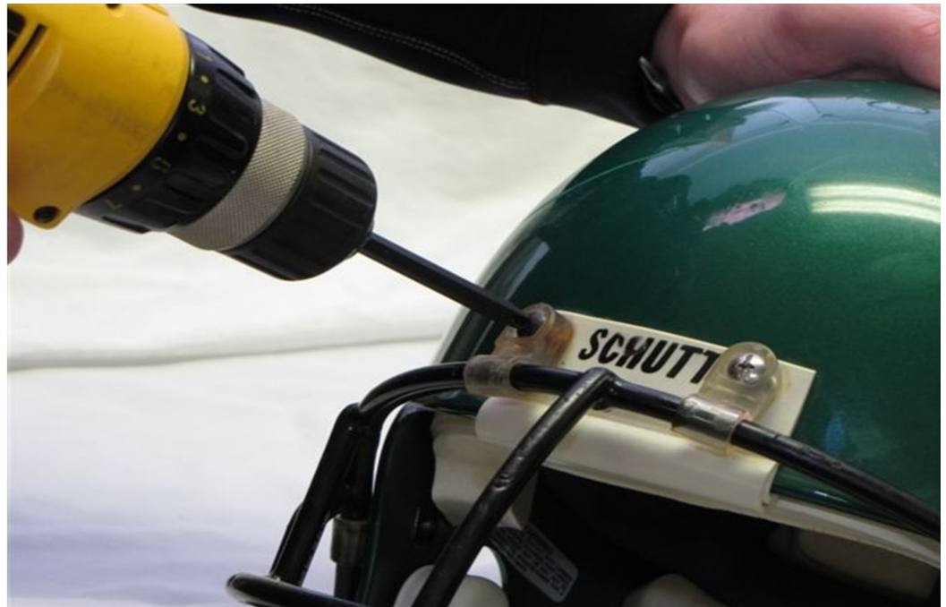
FIGURE 1: Faceguard removal

Removal of the faceguard using an electric screwdriver.