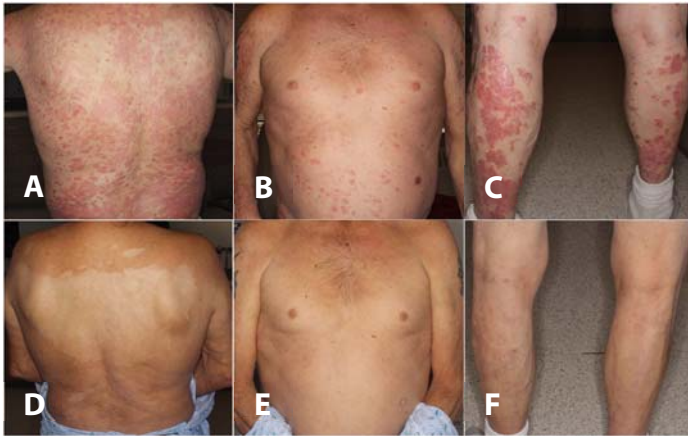
Figure 1. Salmon-colored papules and plaques coalescing into confluent plaques on the patient's A) back, B) chest, and C) lower extremities. D-F) Resolution of plaques following four months of treatment with ixekizumab.

combination treatment with atezolizumab (PDL1 inhibitor) and bevacizumab (vascular endothelial growth factor [VEGF] inhibitor) for metastatic hepatocellular carcinoma. The patient's previous history of psoriasis consisted of limited scalp involvement. The rash rapidly developed over the course of a few days and was associated with severe pruritus and skin tightness. Owing to the diffuse involvement and severe symptoms, his oncologist discontinued atezolizumab for the fourth cycle of treatment and prescribed oral prednisone and clobetasol for the rash.