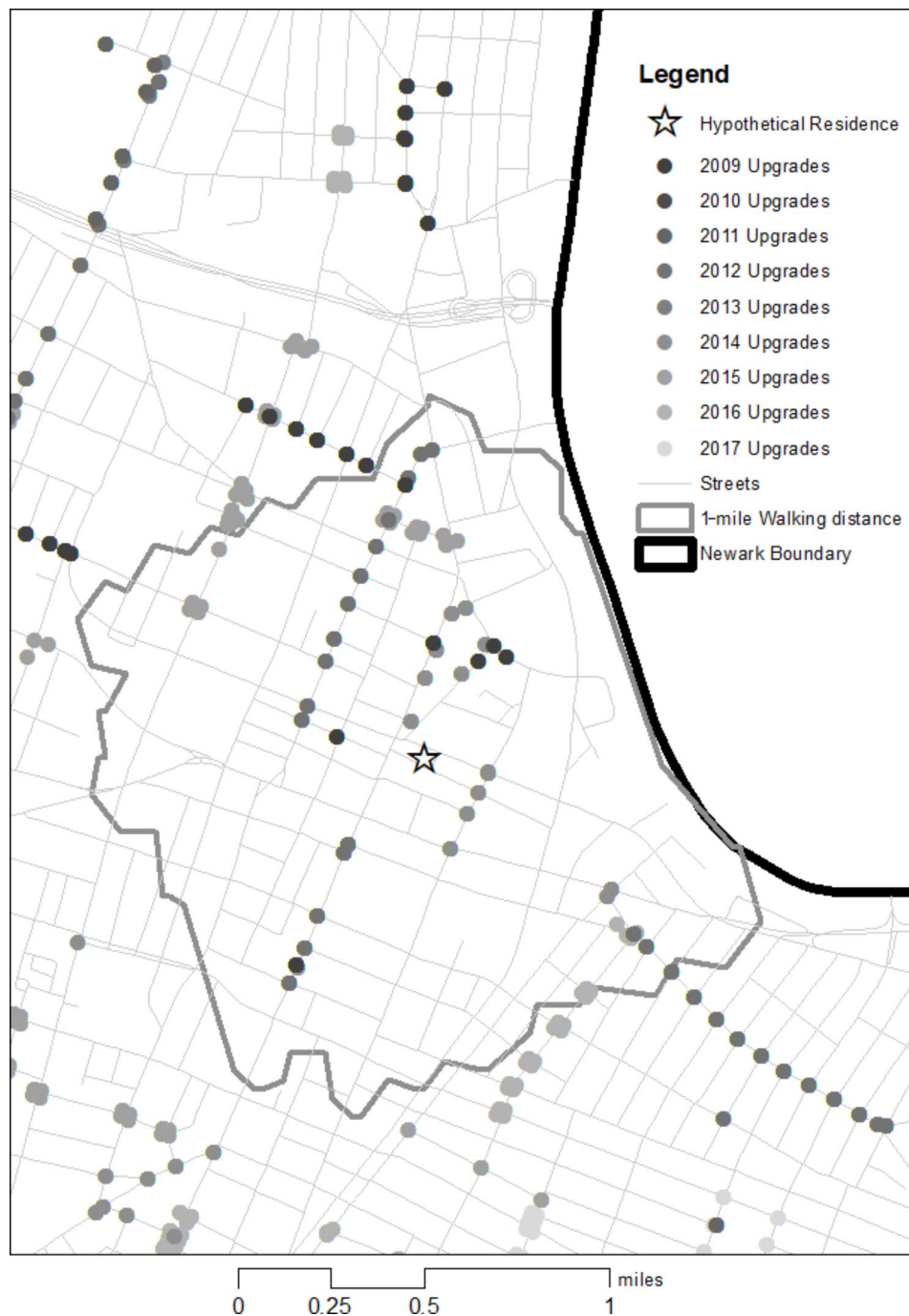
Fig. 2 Hypothetical respondent's place of residence, along with the measurement of PA upgrades over time within the 1-mile road network buffer

the exposure measure, but also the timing and duration of these changes. After examining the distribution in this exposure variable across the three different radii (0.25, 0.5, and 1 mile(s)), we found the 1-mile radius to exhibit the most variation and to be best suited for analysis.