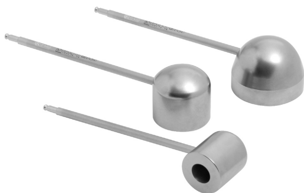
Figure 1 Leipzig applicator set.

prescribed to a depth of 3 mm or less. The prescription dose was 42 Gy in 6 or 7 fractions, delivered 2 to 3 times per week, with a minimum interval of 48 hours between fractions and not exceeding 3 weeks.