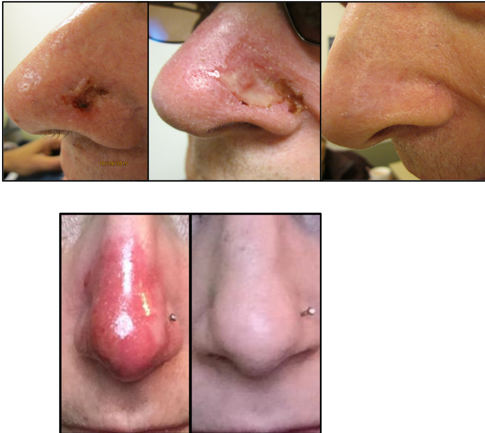
Figure 3 Toxicity course- top image of a treated KC at 2 weeks, 3 months, and 6 months post-treatment. Bottom image- treated KC at 2 weeks and 3 months post-treatment.