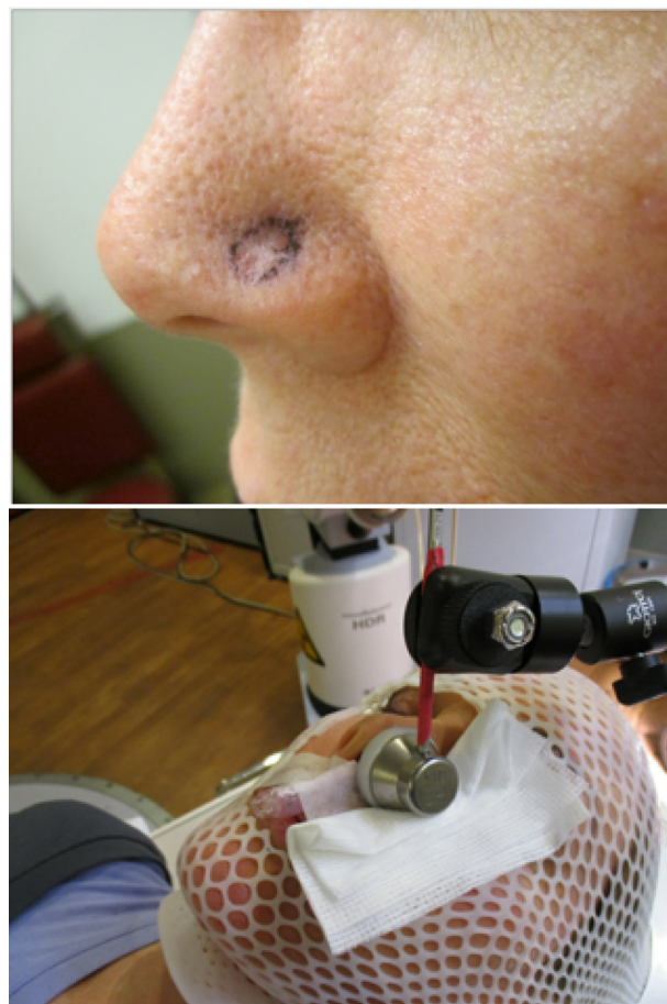
Figure 2 KC on the left nasal ala ( top ). KC treated using Leipzig applicator and articulated arm device ( bottom ). Abbreviation: KC = keratinocyte carcinoma.

To assess clinical outcomes, electronic medical records of all patients were searched for last follow-up with clinical documentation by either the treating radiation oncologist or referring dermatologist. In addition, all available patients were contacted and interviewed by a