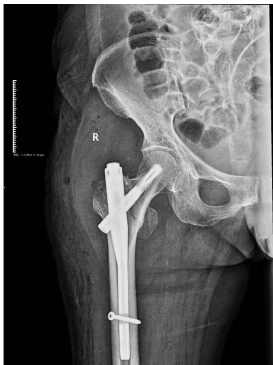
Figure 1: Male, 85Y, post-op with PFNA.