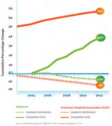
Figure 1. Inpatient Admissions Decrease as Outpatient Visits Increase

Clinical and technological advances that allow for procedures outside the hospital, and declining reimbursements from both