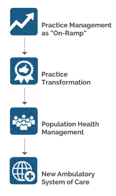
Figure 3. New ambulatory system of care