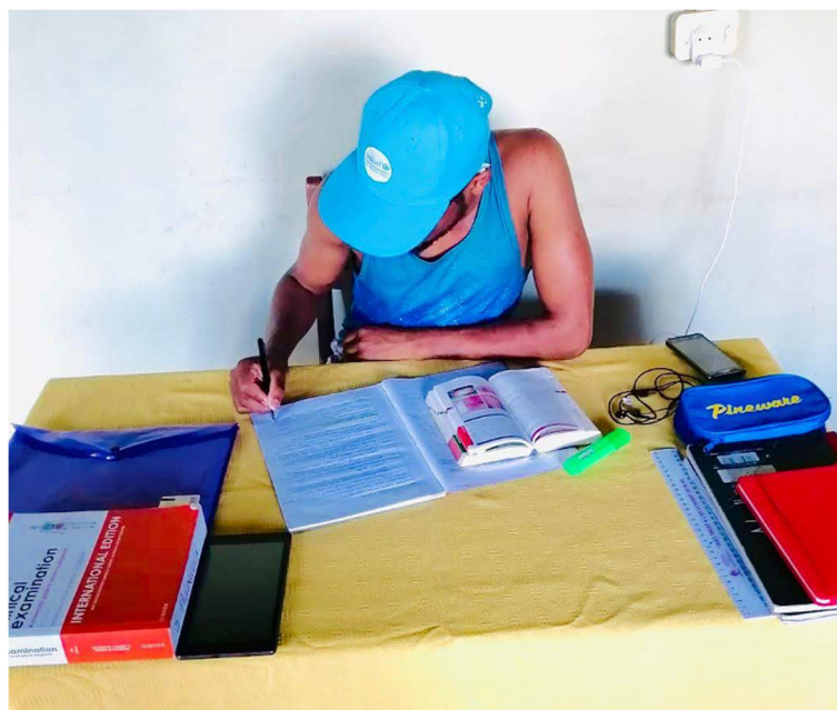
Fig. 6 Photo taken by a male in Durbin, South Africa of his workspace during lockdown

pregnant women, etc., from the place where they came to work in a major metro city of India. These workers are mostly daily wagers but due to lockdown which was announced on the 24 th of March led to closure of all large and small scale industries in India. This has put workers into deep crisis as their source of income halted.”(Insert Fig. 8 here, Photo taken by a female in Mumbai, India of workers in India.)