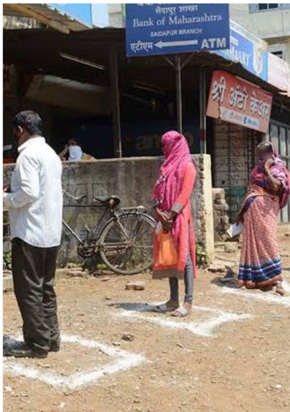
Fig. 11 Photo taken by a male in Mumbai, India of people practicing social distancing measures in India

pandemic may provide students with the opportunity to discover how to deal with emotional distress and develop coping skills required to work in high stress environments. As one individual stated, “[when I was feeling overwhelmed] I decided to give myself a break and go to the stairs and breathe a little fresh air”. Recognizing one’s own emotional state and how to regulate it is essential for medical students as they learn to work in the high stress medical environment. Educators can help students by incorporating reflection in assignments and having open conversations about wellness [31].