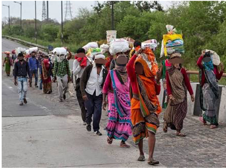
Fig. 8 Photo taken by a female in Mumbai, India of workers in India

photo and explained that safety restrictions made it hard to process loss (Fig. 13).