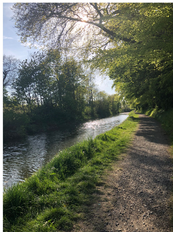
Fig. 3 Photo taken by a female in Dublin, Ireland of her nature scenery

“So, I would say that in this pandemic I would like to stay positive and work on myself rather than complaining of things I do not have control over!” (Female – Tbilisi, Georgia).