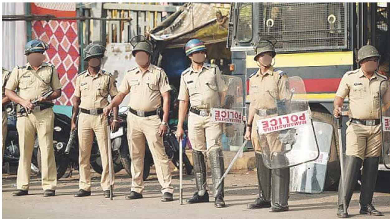
Fig. 9 Photo taken by a male in Mumbai, India of police in India

she wasn’t able to see his body or to even have a moment of grief in the funeral. This picture for me represents the dark side of this pandemic, represents the fact that death can occur to everyone in any context.” (Insert Fig. 13 here, Photo taken by a female in Mexico City, Mexico of her mother’s hands.)