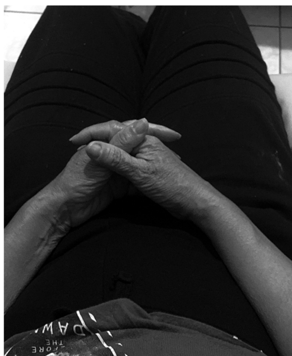
Fig. 13 Photo taken by a female in Mexico City, Mexico of her mother's hands

Our research should be interpreted in light of its limitations. This study was conducted between April and May of 2020 while the COVID-19 pandemic was still evolving rapidly. Findings and reflections may have changed over time as new information on the virus was learned. Additionally, while students from 13 countries were included in this study, they do not represent the ideals or behaviors of their respective countries as a whole. Trends were identified amongst students but cannot be generalized to their communities or to countries not included in this study. Finally, there are inherent limitations to self-reported data that stem from various social and psychological factors, including social desirability bias, which could distort photo-elicitation reflections in this study. Future studies examining long term sequela should be conducted to determine the impact of altered learning approaches on student development. Studies comparing new online modules are needed as education shifts towards more electronic based programs. Additionally, wellness programs should be evaluated in order to promote mental health amongst students.