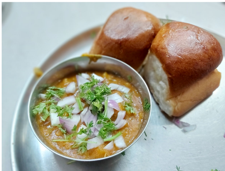
Fig. 4 Photo taken by a female in Pune, India of her “pau bhaji,” a famous Indian dish