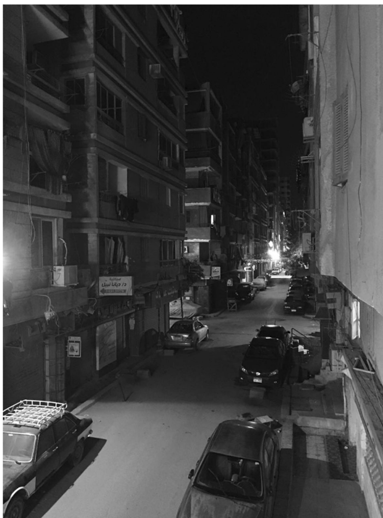
Fig. 7 Photo taken by a male in Cairo, Egypt of a quiet street in Cairo

Photo taken by a male in Mumbai, India of people practicing social distancing measures in India.)