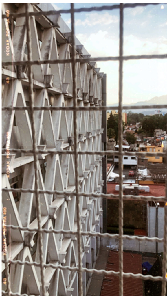
Fig. 2 Photo taken by female in Mexico City, Mexico of her stair view

“I felt very overwhelmed and decided to give myself a break and go to the stairs and breathe a little bit of fresh air.” (Insert Fig. 2 here, Photo taken by female in Mexico City, Mexico of her stair view.)