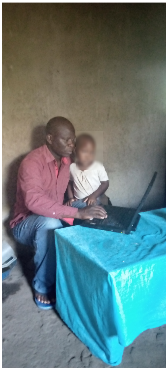
Fig. 5 Photo taken by a male in Kable, Uganda of his workspace during lockdown

"Lockdown restrictions meant contact classes cannot continue and thus universities across the country adopted online learning. That meant, I had to work from home which has been quite a challenge on its own. I try to put at least 6 hours study time a day and sometimes that is impossible due to the conduciveness of the study space. I therefore work at night, because there are less distractions and I am