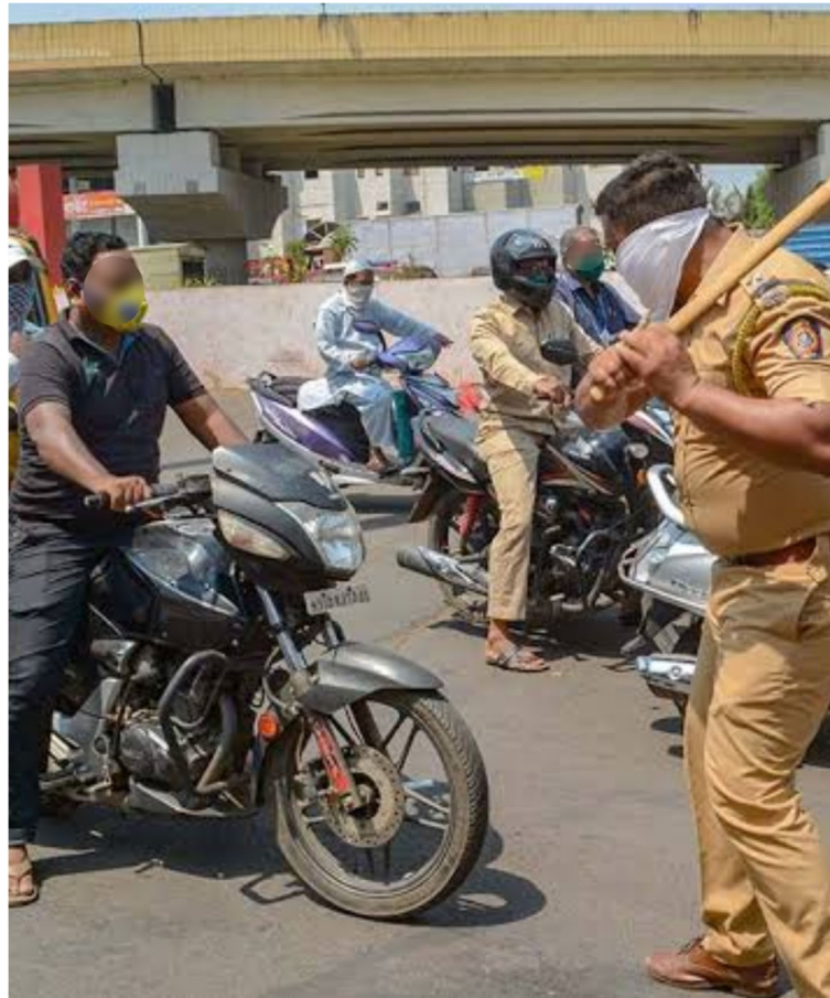
Fig. 10 Photo taken by a male in Mumbai, India of police taking action against citizens who are not abiding by lockdown security measures