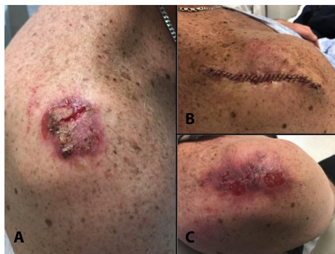
Figure 1. A) Right shoulder at time of initial presentation showing a pink pearly, ulcerated plaque with thick crust. B) Right shoulder after treatment with Mohs micrographic surgery for basal cell carcinoma. C) Right shoulder six weeks after the procedure showing an ulcerated, erythematous to violaceous plaque.

Mohs microscopic surgery performed two weeks later again demonstrated suprabasal acantholysis on frozen sectioning with residual BCC. Mohs microscopic surgery was completed in two stages followed by a linear closure ( Figure 1B ). Sutures were removed two weeks later without incident.