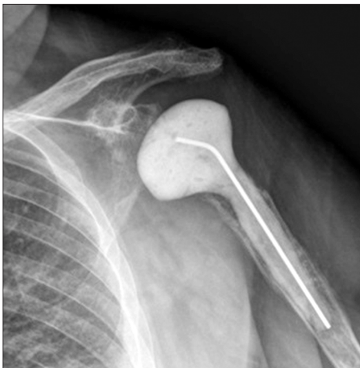
Fig. 1. Anteroposterior radiograph of a stemmed implant.