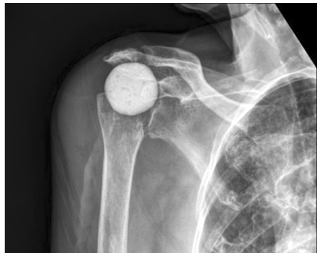
Fig. 2. Anteroposterior radiograph of a stemless implant.