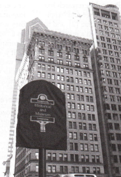
Preparing for the unveiling on a beautiful day

Next time you are in Philadelphia, swing by 1420-22 Chestnut Street to view the historical marker commemorating the founding of MLA.