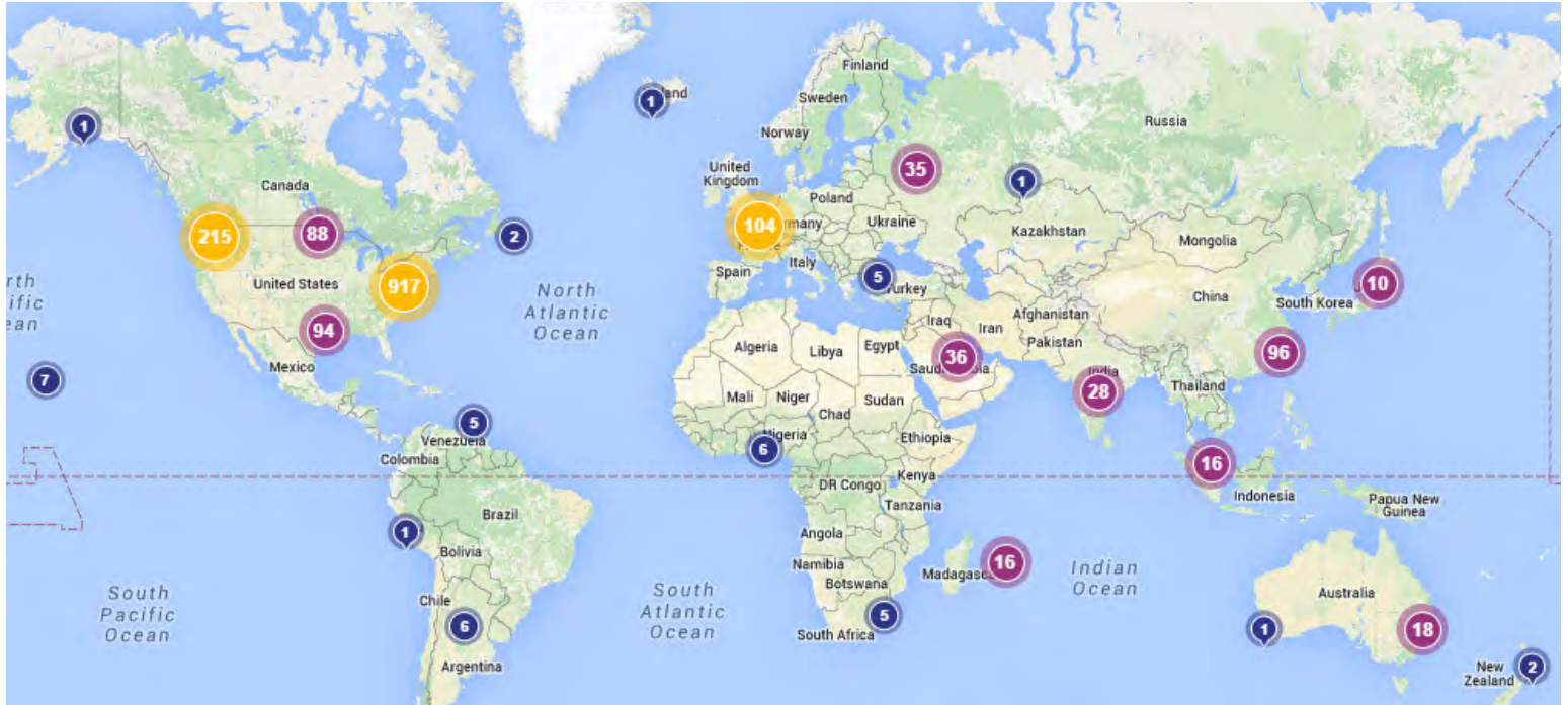
Readership distribution from December 16, 2014 to May 5, 2016 for the JCIPE newsletter.