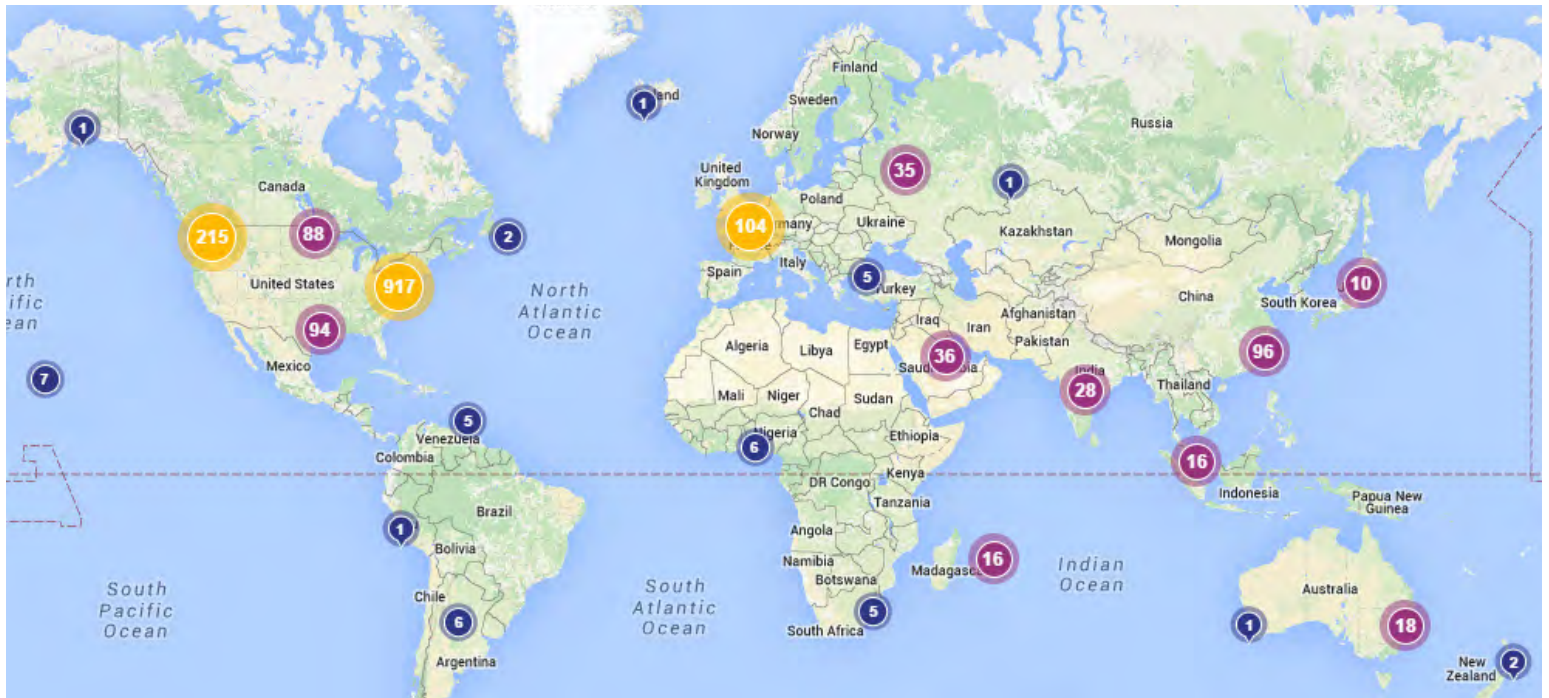
Readership distribution from December 16, 2014 to May 5, 2016 for the JCIPE newsletter.