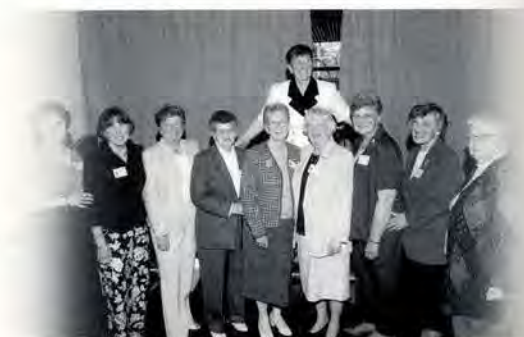
Central PA Satellite