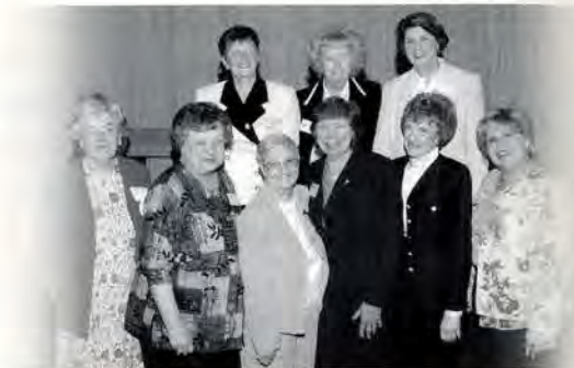
Board of Directors