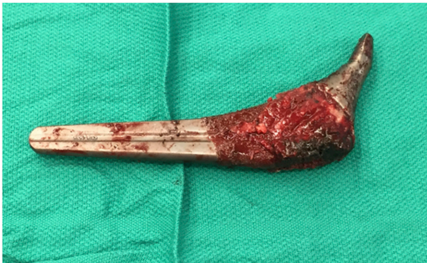
Fig. 2 Severe deformation with weight-bearing and wear near the tip of the trunnion.

C ASE 2. A 63-year-old man with a BMI of 46.2 kg/m 2 presented to our clinic 6 years and 7 months after undergoing an index total hip arthroplasty at an outside facility. The acetabular