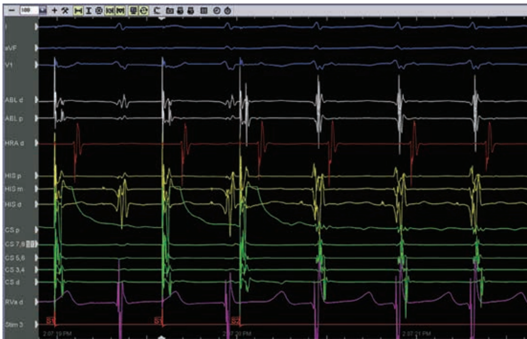
Figure 1: Atrial extra-stimulus causing an AH “jump” that initiated a narrow-complex, short R–P, A-on-V tachycardia consistent with AVNRT.