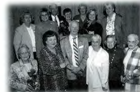
Executive Board & Volunteers