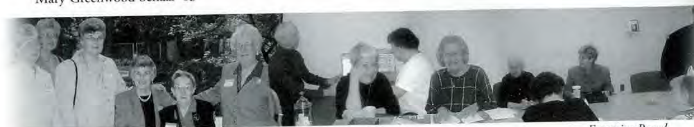
Central PA - Satellite