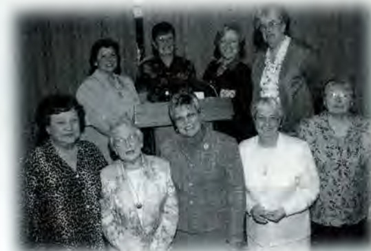
Executive Board Members