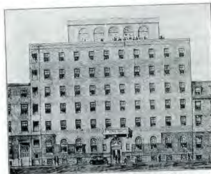
Artists Sketch of Proposed Nurses' Home Spruce Street Elevation

Respectively Submitted, Vera Paoletti '69 Nominating Chair