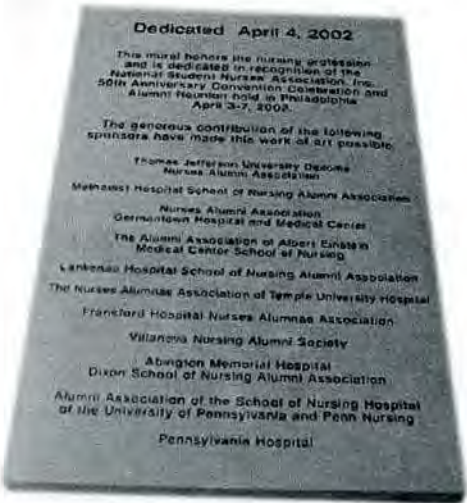
Nursing Mural Dedicated April 4, 2002 Located at Broad and Vine Streets Philadelphia, PA