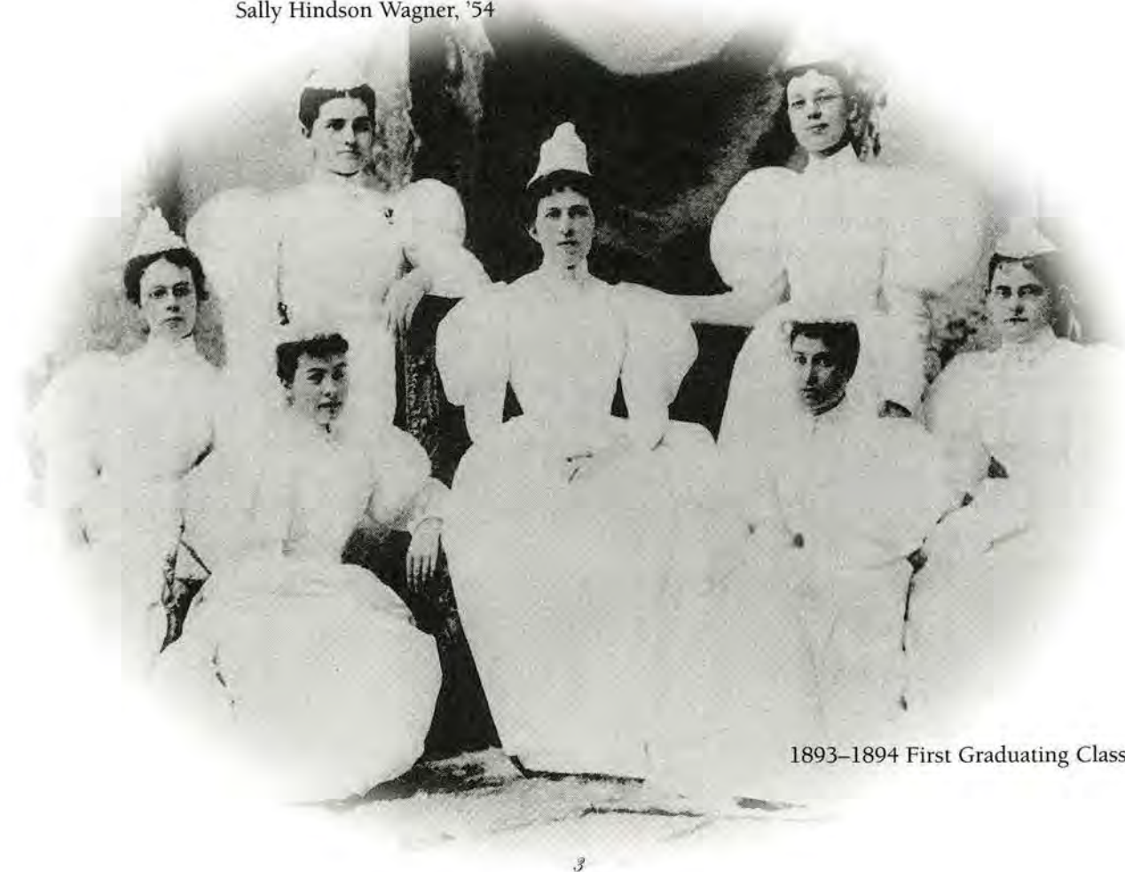
1893-1894 First Graduating Class