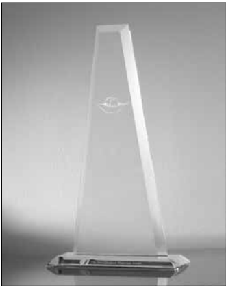
The Miss Janet C. Hindson Award