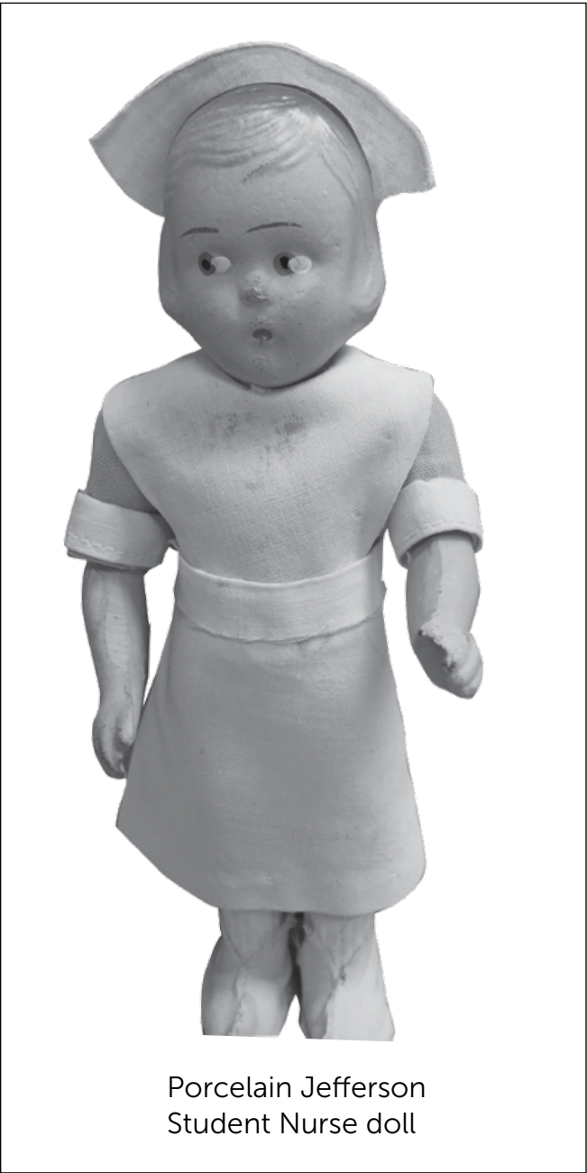
Porcelain Jefferson Student Nurse doll

are caregivers for a family member or friend. Also, many of us are volunteering our time and talent in a community or charitable program.