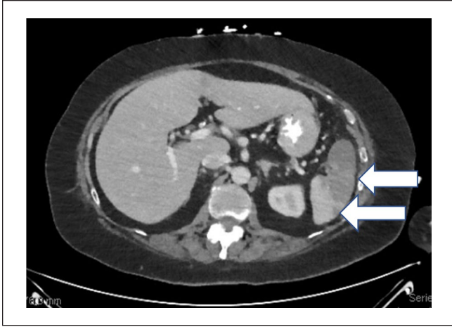
Figure 1. Axial contrast abdominal computed tomography demonstrating multiple areas of splenic infarction.

Her laboratory tests were significant for severely elevated creatinine of 9.56 (baseline Cr 0.56), hyponatremia with a sodium of 124 and metabolic acidosis with bicarbonate level of 9 (high anion gap and non-anion gap metabolic acidosis). Complete blood count was significant for thrombocytosis with a platelet count of 493. Venous blood gas showed a pH of 7.13, pCO 2 of 37, pO 2 of 43, bicarbonate of 12. Electrocardiography was normal, with regular rate and rhythm.