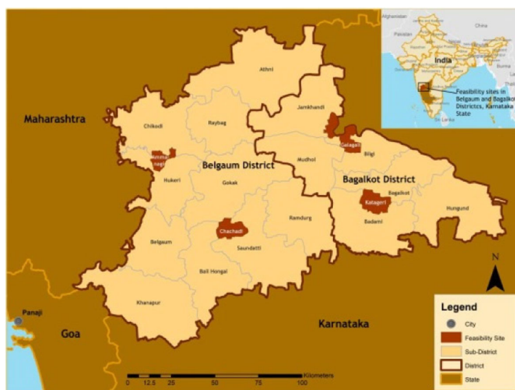
Fig. 1 Map of the study site

health services to rural areas. ASHAs are females between the ages of 25 to 45 years, with an education equivalent to grade eight or higher, who are selected by the local government to serve in their residential areas. Each ASHA extends her services to a population of about 1000 individuals. ASHAs are trained to provide health care advice in the homes (provision of basic maternity care, child care and nutrition counselling), create community health awareness, conducting social