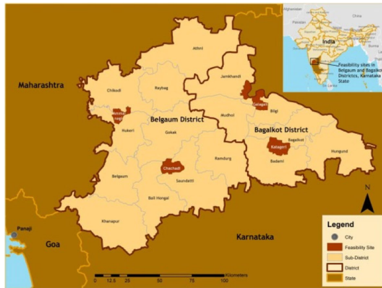
Fig. 1 Map of the study site

health services to rural areas. ASHAs are females between the ages of 25 to 45 years, with an education equivalent to grade eight or higher, who are selected by the local government to serve in their residential areas. Each ASHA extends her services to a population of about 1000 individuals. ASHAs are trained to provide health care advice in the homes (provision of basic maternity care, child care and nutrition counselling), create community health awareness, conducting social