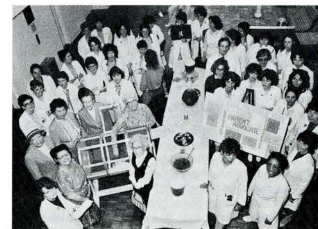
Celebrating National Nurses Day at Jefferson

Cumberland County School Nurses are proud of the schools they serve, they are proud to be part of the team that shapes the future of our youth, and they are proud of the stand they have taken against drugs in school, unless prescribed by a doctor.