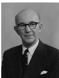
FIG. 1. Portrait of Dr. Robert Reynolds Macintosh, 1961.