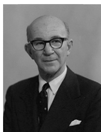
FIG. 1. Portrait of Dr. Robert Reynolds Macintosh, 1961.