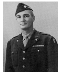
FIG. 2. Lt. Col. John H. Gibbon, Jr., circa 1944.