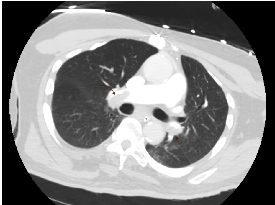
FIGURE 3: CT With Contrast

On day 3 of hospitalization, an echocardiogram was ordered that revealed right ventricular dysfunction with pulmonary hypertension. Urgent CT with contrast showed extensive bilateral central pulmonary emboli with multiple filling defects distally in the right and left pulmonary arteries extending to the pulmonary artery branches to all lobes of the lung (Figure 3). Interestingly, he maintained adequate arterial oxygen saturation ( \text{SaO}_2 ) on 40% of the fraction of inspired oxygen ( \text{FiO}_2 ) and positive end-expiratory pressure (PEEP) of 5 cm \text{H}_2\text{O} . His blood pressure remained to be stable despite multiple vasoconstrictors, and central venous pressure (CVP) was moderately elevated per the pulmonary artery catheter. There was no evidence of cardiogenic shock or lactic acidosis. He had a low clinical indication for urgent tissue plasminogen activator (tPA) after considering the risk and benefits and was instead treated with therapeutic intravenous (IV) heparin. The presenting chief complaint of the near-syncope episode along with the later in-hospital PEA arrest was thought to be related to the hidden extensive bilateral PEs. He remained to be hemodynamically stable overnight.