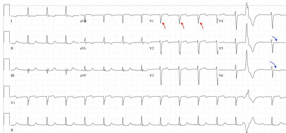
FIGURE 2: Electrocardiography

On day 2 of hospitalization, a code blue was activated due to the sudden onset of pulseless electrical activity (PEA) arrest as the patient was found to be unresponsive in bed. He was hemodynamically stable and saturating well on room air prior to the code activation. He also denied chest pain, diaphoresis, or dyspnea. Emergent high-quality cardiopulmonary resuscitation (CPR) began according to the advanced cardiovascular life support (ACLS) protocol as the return of spontaneous circulation (ROSC) was later achieved. The patient was intubated, sedated, and transferred to the cardiac surgical unit (CSU) for further management. EKG during the code blue revealed findings that were concerning for anterolateral myocardial infarction (Figure 2). The patient was taken to the cardiac catheterization laboratory for an urgent exploration of the coronary arteries as troponin levels were trending upwards to possibly explain for the PEA arrest. Catheterization showed patent bypass grafts along with a hyperdynamic left ventricular systolic function. He remained to be stable overnight.