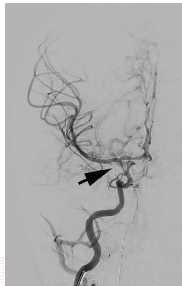
Figure 1. Angiogram showing the stenosis of the right internal artery (arrow) in 18-month old boy with a new diagnosis of MoyaMoya disease.