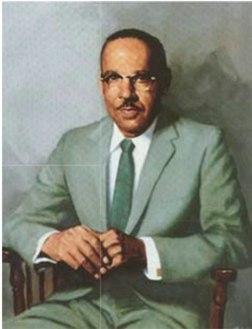
FIG. 3. Vivien Thomas' portrait in the Blalock Building, first floor lobby. Available at: www.medicalarchives.jhmi.edu/vtcllg.jpg . Accessed May 18, 2013.

and appreciated her dedication to the field. In previous research attempting to replicate the physiologic effects of pulmonary arterial hypertension, Dr. Blalock and Thomas had proposed an artificial ductus system, so Dr. Taussig's idea was quite intriguing to Dr. Blalock. 5