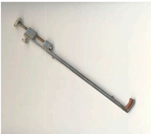
FIG. 2. Vascular clamp designed by Vivien Thomas and William Longmire. Available at: www.medicalarchives.jhmi.edu/clampbg.jpg . Accessed May 18, 2013.

designed in collaboration with Dr. William Longmire. 2 Thomas also assisted William Kouwenhoven, an electrical engineer, in the production of the electrical cardiac defibrillator. 1