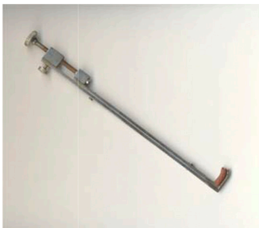
FIG. 2. Vascular clamp designed by Vivien Thomas and William Longmire. Available at: www.medicalarchives.jhmi.edu/clampbg.jpg . Accessed May 18, 2013.

designed in collaboration with Dr. William Longmire. 2 Thomas also assisted William Kouwenhoven, an electrical engineer, in the production of the electrical cardiac defibrillator. 1