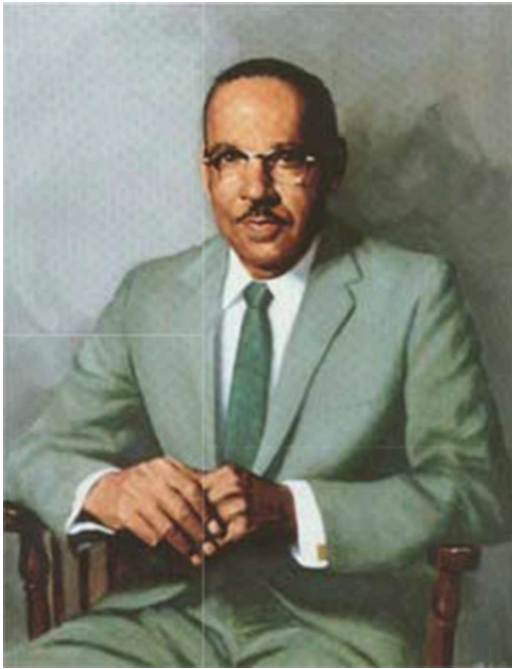
FIG. 3. Vivien Thomas' portrait in the Blalock Building, first floor lobby. Available at: www.medicalarchives.jhmi.edu/vtcllg.jpg . Accessed May 18, 2013.

and appreciated her dedication to the field. In previous research attempting to replicate the physiologic effects of pulmonary arterial hypertension, Dr. Blalock and Thomas had proposed an artificial ductus system, so Dr. Taussig's idea was quite intriguing to Dr. Blalock. 5