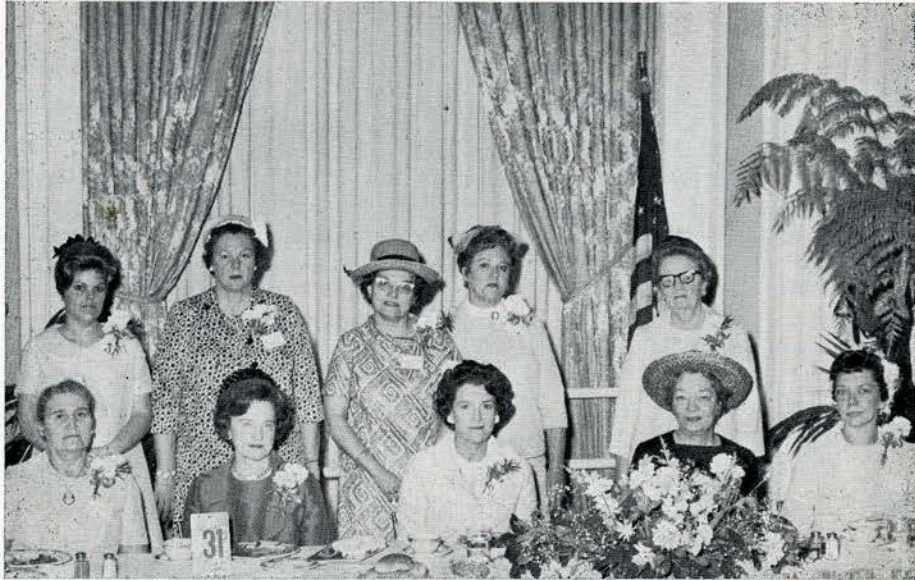
OFFICERS AND GUEST SPEAKERS