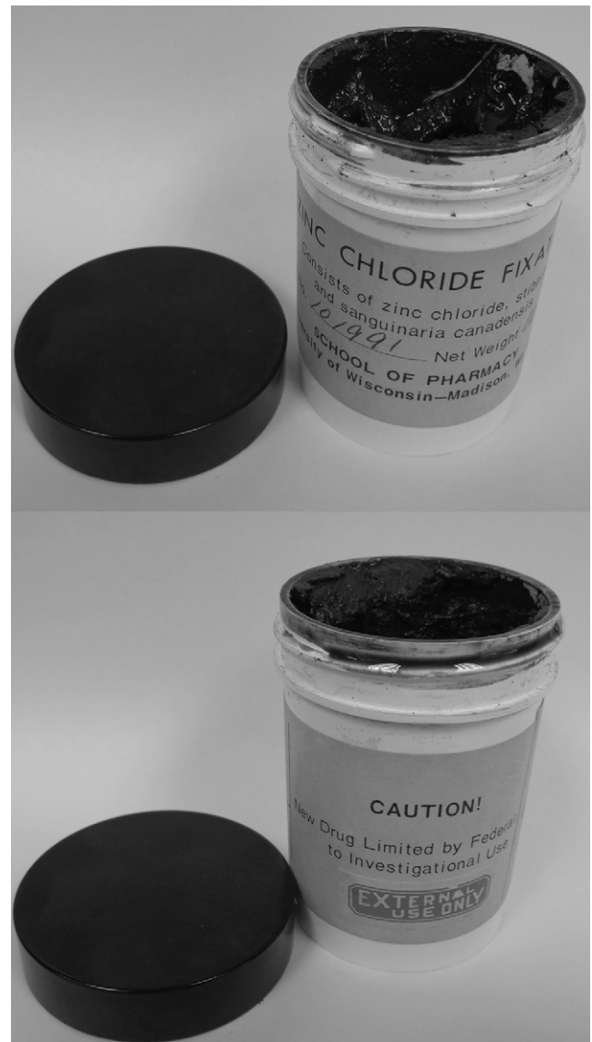
FIG. 3. Zinc chloride fixative paste, original specimen.

The early process of what was to evolve into Mohs surgery is described below. Each lesion was prepared for excision with an application of acetic acid. 8 Once keratin debris was scraped clear, a black fixative paste was applied. It was composed of 30 grams of stibnite (80 mesh sieve), 10 grams of powdered Sanguinaria canadensis root and 34.5 cubic centimeters of saturated zinc chloride solution in a base of clinker obtained from the university’s heating plant furnaces (Fig. 3). 9, 10 Fixation spanned several hours to one day. 12 The carcinoma was removed layer by layer at