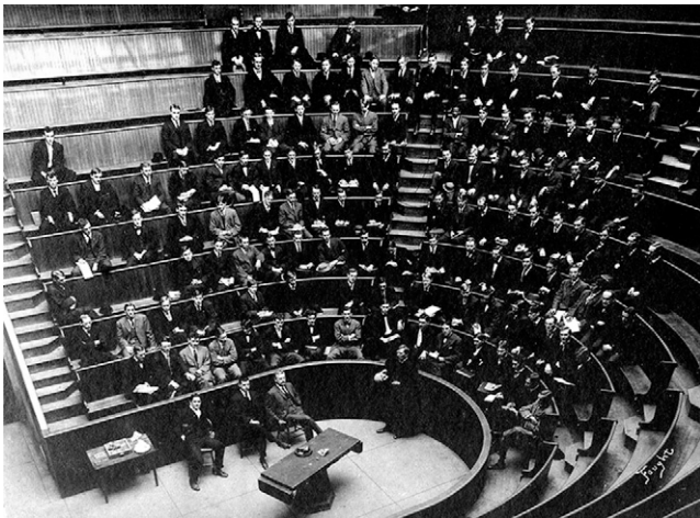
FIG. 3. The operating table in the Upper Amphitheater of the 1898 Medical College Building on the corner of 10th and Walnut Streets in Philadelphia. Dr. DaCosta is seated closest to the head of the table, ground level, third from the left in a gray suit.

and capable. It was made for grim practical uses and not for show. . . an old scarred veteran, retired after years of active service to end its days of vivid experience in the familiar surroundings of a bull pit.” 6 Dr. DaCosta commissioned the Jefferson medical students to have the table repaired and restored to its rightful place of veneration within the college. To further honor the artifact, the classes of 1916 and 1917 each dedicated bronze tablets to opposite ends of the table that cite lists of surgeons who were known to have operated on it. These lists include John Chalmers DaCosta himself along with other notables such as Samuel D. Gross, Joseph Pancoast, Samuel W. Gross,