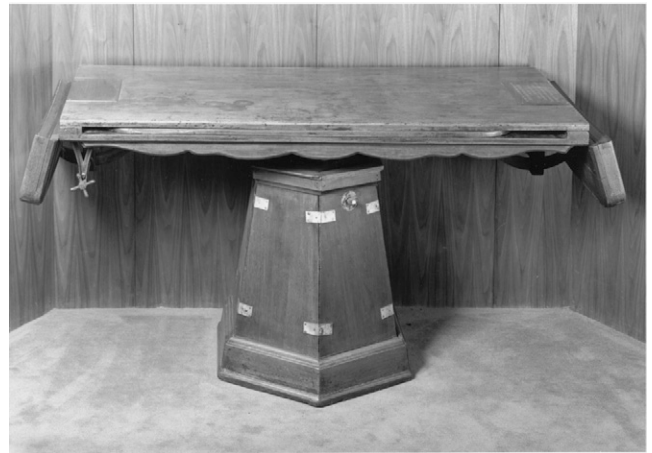
FIG. 2. The operating table positioned in the alcove of the Gross Conference Room of the College Building at Jefferson Medical College. Reprinted from Berkowitz JS. College Clinic Operating Table. Adorn the Halls: History of the Art Collection at Thomas Jefferson University. 1999:183.

Constructed sometime between the years 1850 and 1855 by an unknown manufacturer in America, the operating table spent many years in use as the platform on which countless patients entrusted their lives and well-being to a surgeon in hopes of alleviating their illness. It is made of solid walnut, fashioned into a basic rectangular top with hinged leaves at either end measuring 34.5 \times 65.25 \times 24.25 inches (Fig. 2). The central plank of the table is also equipped with a pocket side panel, which allows for a sliding leaf to be inserted inside, increasing the width of the table. The