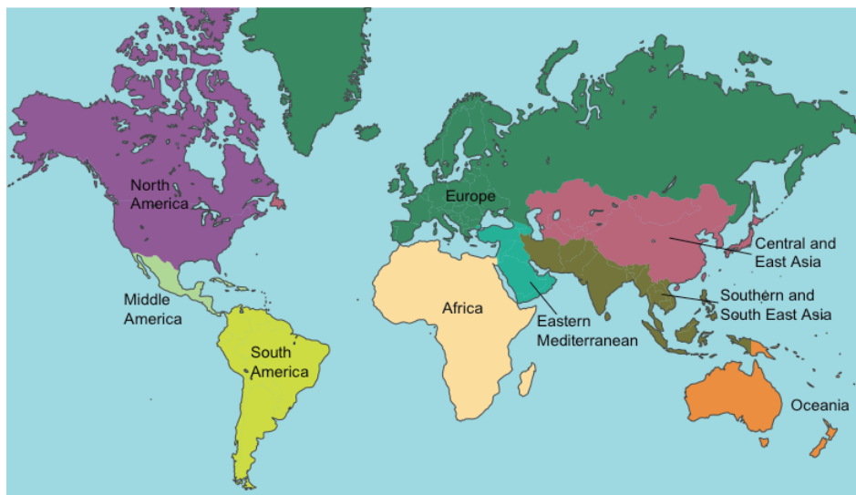
Fig. 2. Areas and sub-areas of the world (from reference 3).

In parallel with the growth of the organization, ISPRM decided during the 2011 Congress in Puerto Rico, to end relations with the previous Central Office and to look for a new man-