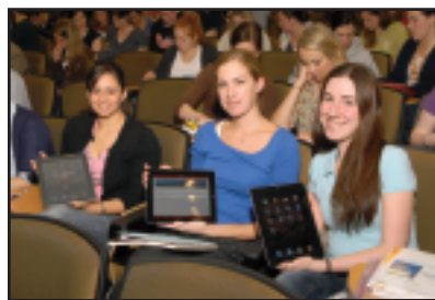
JSN iPad distribution and orientation

The Scott Library Circulation Desk has wireless keyboards and connectable large monitors available for individual and group study. The Circulation Desk will also provide wireless printing directly from the iPad. A special