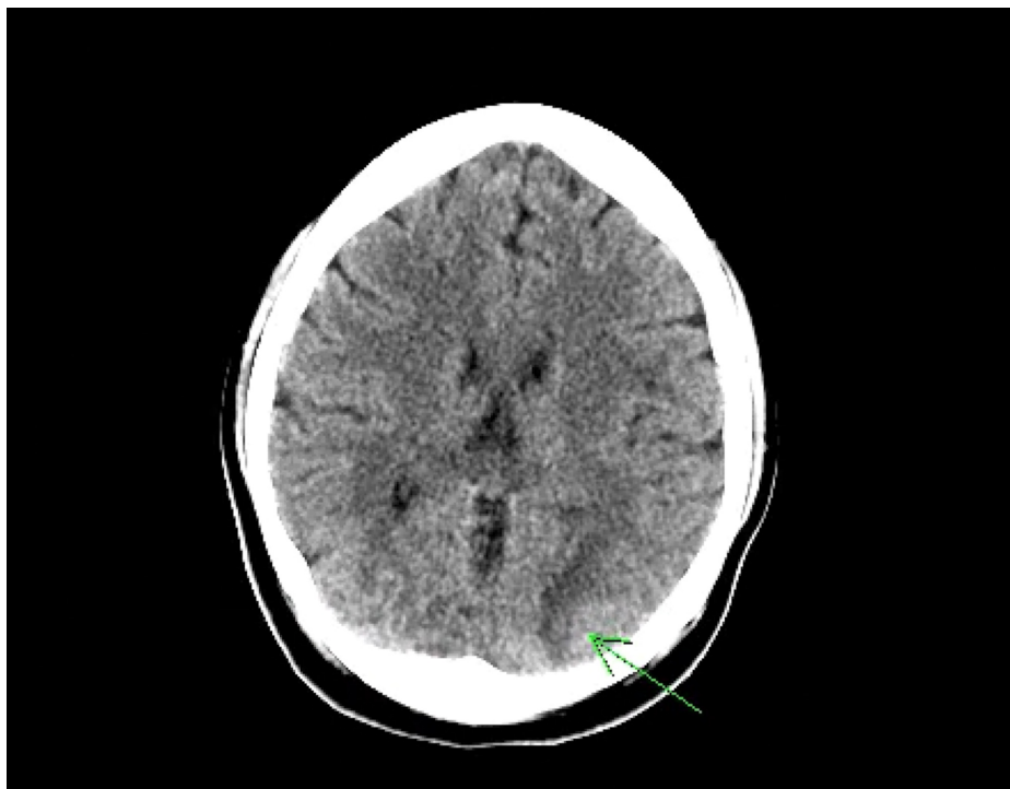
FIGURE 1: CT Head Without Contrast

intact recent and remote memory. Her visual field was normal by quadrant. Extraocular muscles were intact without gaze deviation, nystagmus, or ptosis. Pupils were equal and reactive to light. Normal motor strength and sensation were present throughout the body with negative Babinski sign. Cranial nerves 2-12 were intact. The rest of the physical examinations were unremarkable. Pertinent laboratory findings were hemoglobin 7.8 g/dL, hematocrit 26.1%, MCV 57.5 FL, MCHC 29.7%, RDW 17.2%, iron 11 ug/dL, iron-binding capacity 395 ug/gL, iron saturation 3%, ferritin <1 ng/mL, and platelet 364k/UL. The electrocardiogram showed normal sinus rhythm. CT head without contrast was concerning for a non-hemorrhagic left occipital lobe infarction in the posterior cerebral artery distribution [Figure 1]. CT angiographic examination demonstrated no focal high-grade intracranial stenosis, occlusion, or vasculitis. MRI of the brain revealed an abnormal increase in signal density on the FLAIR sequence that was consistent with an acute left posterior artery occlusion [Figure 2]. MRA of the brain and neck were subsequently unremarkable for any stenosis, occlusions, or dissections. Transthoracic echocardiogram revealed a small patent foramen ovale that was deemed to be clinically insignificant. She was treated with permissive hypertension, started on atorvastatin, clopidogrel without aspirin due to the history of gastric sleeve. She remained stable overnight.