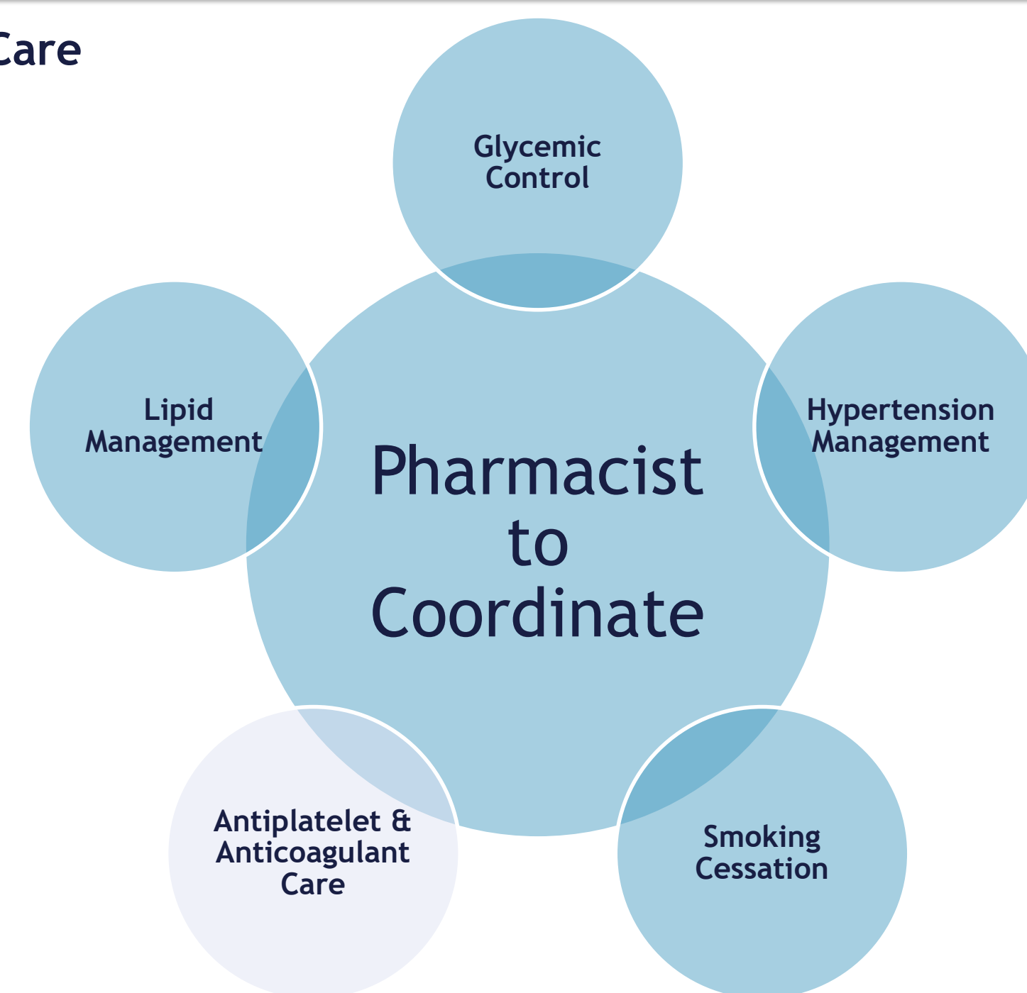
Figure 1. Pillars of Care