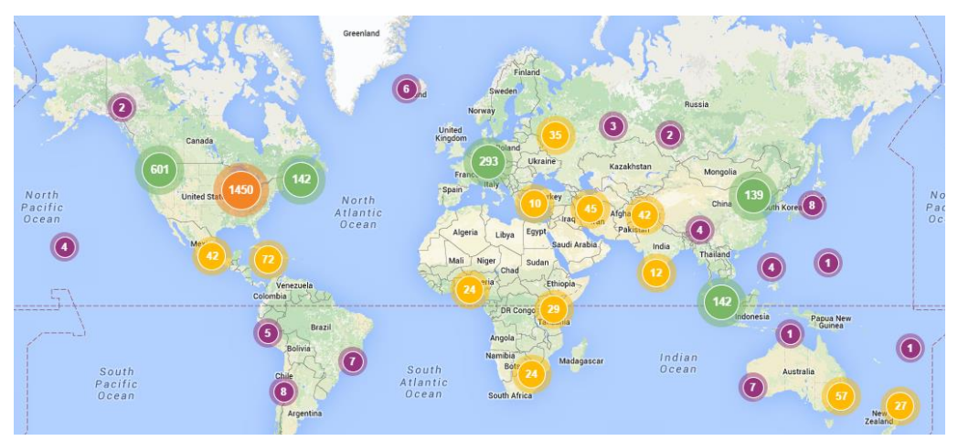
Sample all time author download view

In addition, the author dashboard has been improved to provide authors with access to the realtime download information of every article they publish with the Jefferson Digital Commons