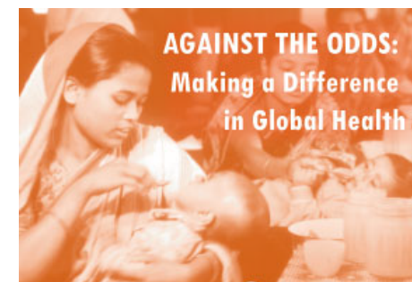
EXHIBIT: Against the Odds: Making a Difference in Global Health

Exhibit highlighting the role of communities in improving health at home and all around the world. Historical and contemporary photographs explored the shared basic needs required for a good quality of life, including nutritious food and clean water, a safe place to live, and affordable health care.