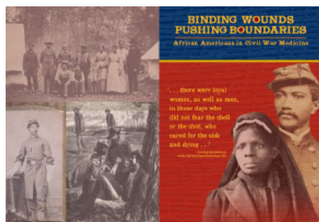
EXHIBIT: Binding Wounds, Pushing Boundaries: African Americans in Civil War Medicine

A look at the men and women who served as surgeons and nurses and how their service as medical providers challenged the prescribed notions of race and gender and pushed the boundaries of the role of African Americans in America.