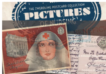
EXHIBIT: Pictures of Nursing: The Zwerdling Postcard Collection

By documenting the relationship of nursing to significant forces in 20th-century life, such as war and disease, these postcards reveal how nursing was seen during those times. Pictures of Nursing investigates the hold these images exert on the public imagination—then and now.