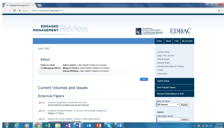
EDBAC’s Journal, Engaged Management Review

The EDBAC annual conference, Engaged Management Scholarship , will be held in Philadelphia this year September 6-9, 2018 hosted by Temple University’s Fox School of Business. All DSL students, faculty, and alumni are invited to attend.