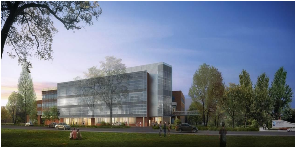
Ronson Health and Applied Science Center