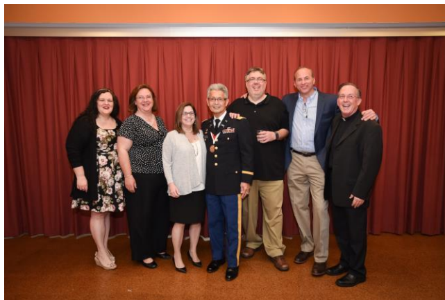
Cohort 1 Pre-Commencement Social